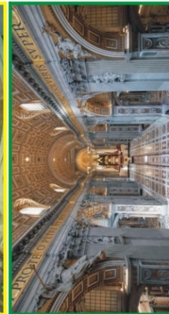
Inside The Vatican