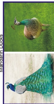
Peacock & Peahen