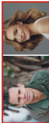
Man & Woman