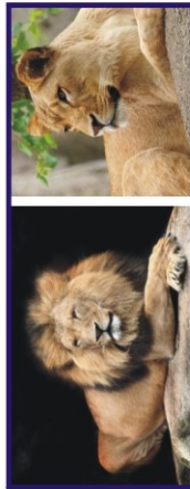
Lion & Lioness