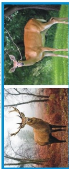
Buck & Doe (Deer)