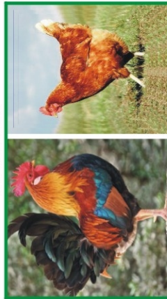
Rooster & Hen