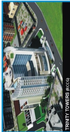
TRINITY TOWERS (RCCG)